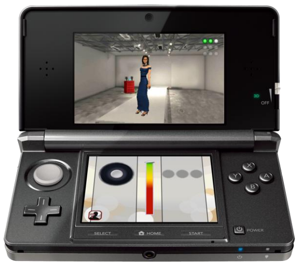
Nintendo 3DS™ 2D image of Nintendo 3DS game. The 3D effect can only be seen when using a Nintendo 3DS system.

The fashion model simulation from TREVA Entertainment for the Nintendo eShop on Nintendo 3DS lets young girl players see if they have the talent and ambition to become an internationally successful supermodel.